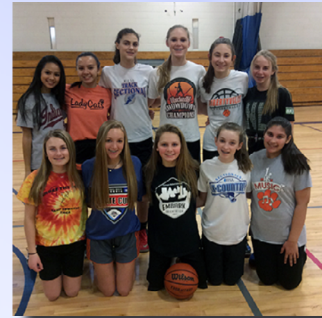
8th grade girls basketball team