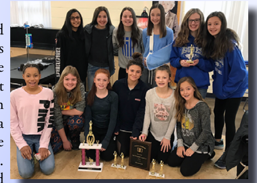
7th grade girls basketball team