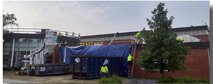
Construction taking place on the north side of the building

As part of Oak Grove's five-year capital improvement plan, the school district is replacing the roof on the 1997 building addition (elementary wing and school office).