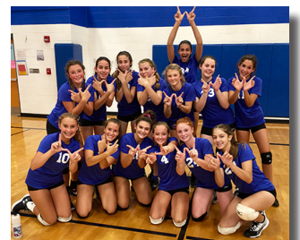
Grade 8 Volleyball Champions